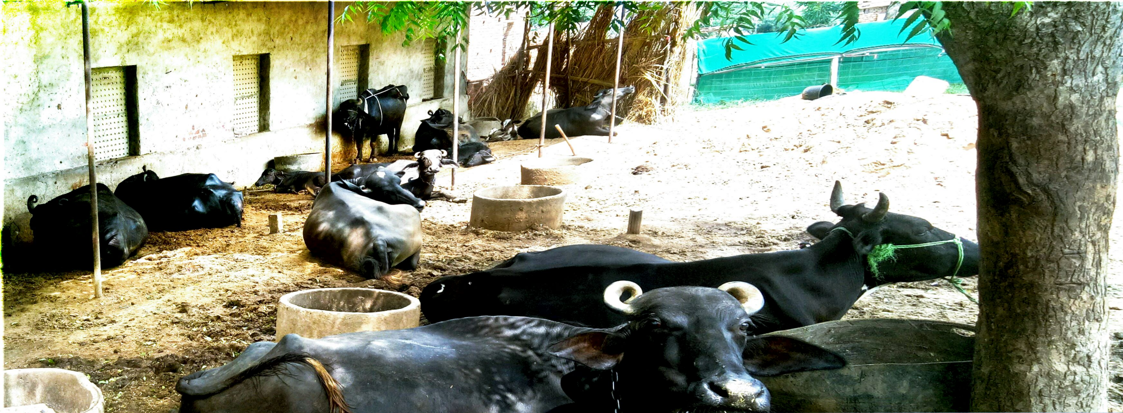
Unnamed Road Bainara Rajasthan 303012 India